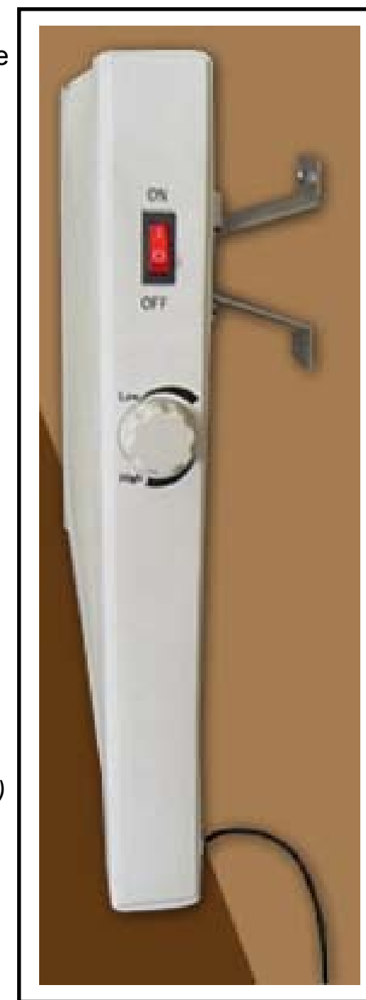
Heater mount on the wall